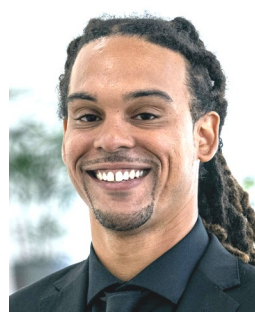
BRAXTON WINSTON II DEMOCRAT