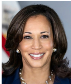
KAMALA HARRIS DEMOCRAT