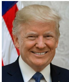
DONALD TRUMP REPUBLICAN