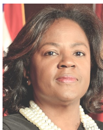
CAROLYN THOMPSON DEMOCRAT

Current Court of Appeals judge; former Superior Court judge and attorney in private practice.