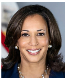
KAMALA HARRIS DEMOCRAT