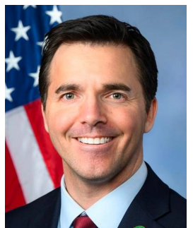
JEFF JACKSON DEMOCRAT

The AG leads the Dept. of Justice, which protects consumers, defends state agencies, and advises local law enforcement.