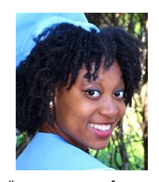
"...too many of my ancestors died for me not to be using my right to vote."